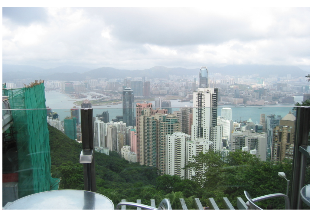
Victoria Harbor in Hong Kong taken from the Peak.

During my vacation to Hong Kong in September 2005, I was impressed by the bamboo scaffoldings used everywhere for construction or repair of buildings. Some have "safety" nets covering the structure. A common method of dismantling this type of scaffold is .. lighting it on fire and burning it Just a guess! SWE members visiting Hong Kong will find a variety of alternative construction techniques that make "good" sense.